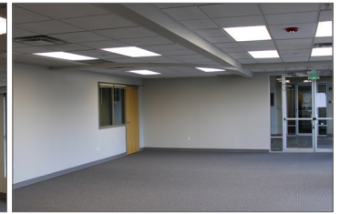
Suite Entrance; Exterior Door to Hallway