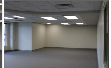
Suite from Entrance