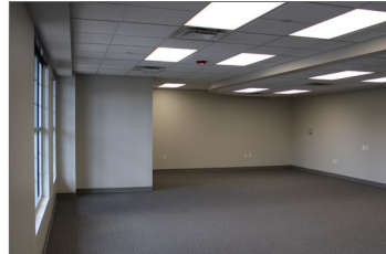
Suite from Entrance