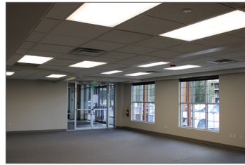
Suite Entrance Facing Southwest