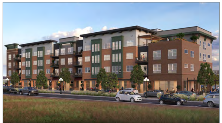
Mainstreet - Corner View