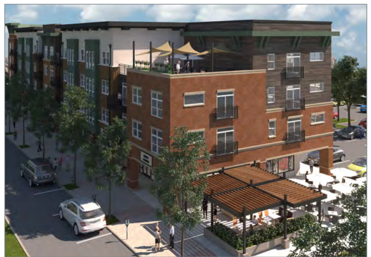
Rooftop / Patio & Outdoor Seating Area