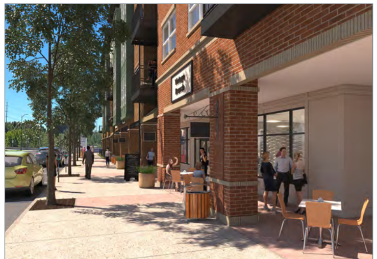
Mainstreet - Street View